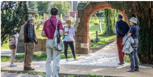
A tour last year

As socialising outdoors in groups of six is now permitted, small guided tours have resumed in April. Many people have been visiting the cemetery independently, but others will have been waiting until things were a little more secure, and it is hoped that these tours with an experienced guide will be popular. There will be one guided tour each Wednesday, Saturday and Sunday afternoon in April. They are free, but must be booked so that the numbers can be managed. Places can be booked using Eventbrite or contact Kate Campbell: community@stpetersberkhamstedfriends.org.uk or telephone 07866 024254.